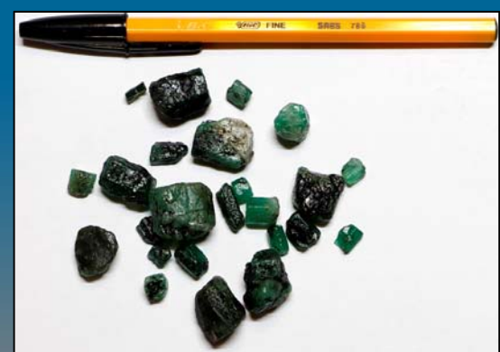
Partially cleaned emeralds ranging from 3.5 to 41.5 carats in weight and 5-25mm in size