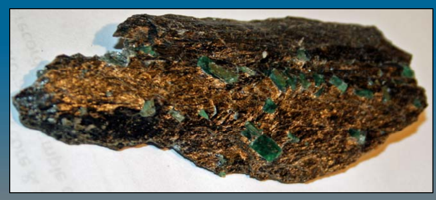
Schist host with emeralds