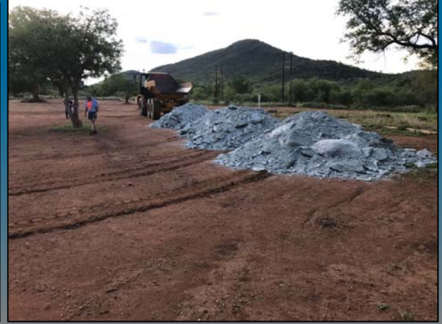
Excavation of waste dump