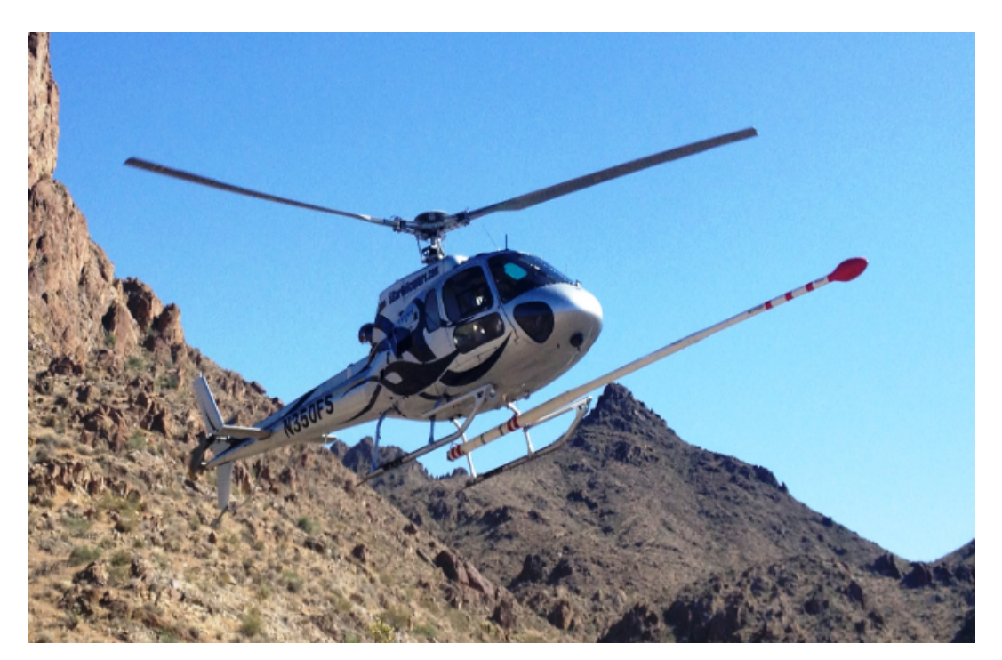
Figure 2 - The survey was completed at low altitude to maximise data resolution using a helicopter platform.