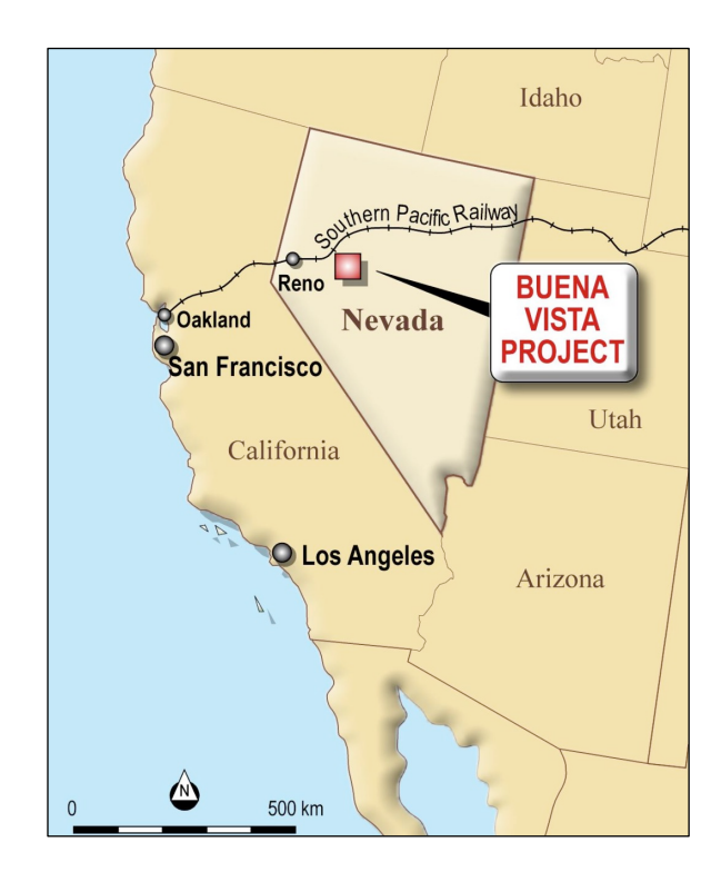
Figure 1 - Buena Vista Green Pig Iron Project Location

The aeromagnetic survey was undertaken using a helicopter platform. Sensor height achieved an average of 27m above ground level. With a flight line spacing of 50m and close along line data readings this survey is considered high resolution.