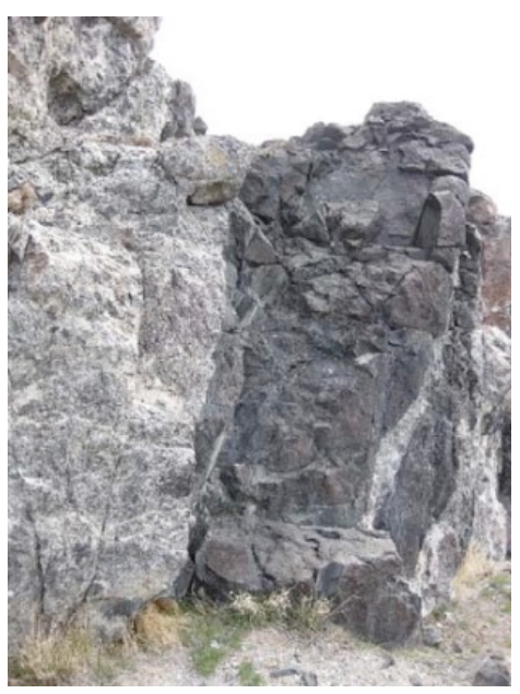
Figure 3 Massive magnetite outcrop in the West Deposit area. These occurrences are known to bloom out with depth

The second campaign will sample an old US Steel stockpile on the property that may provide the initial feed to a beneficiation operation.