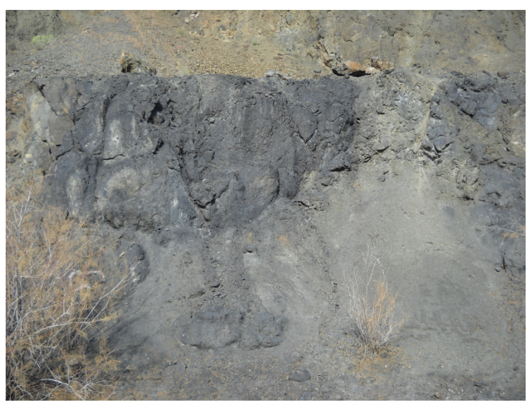
in Figure 1 Massive magnetite outcrop at the West Deposit

Samples where scanned for 40 elements using an Olympus Vanta pXRF unit. This model uses three energy beams to minimise spectral interference in