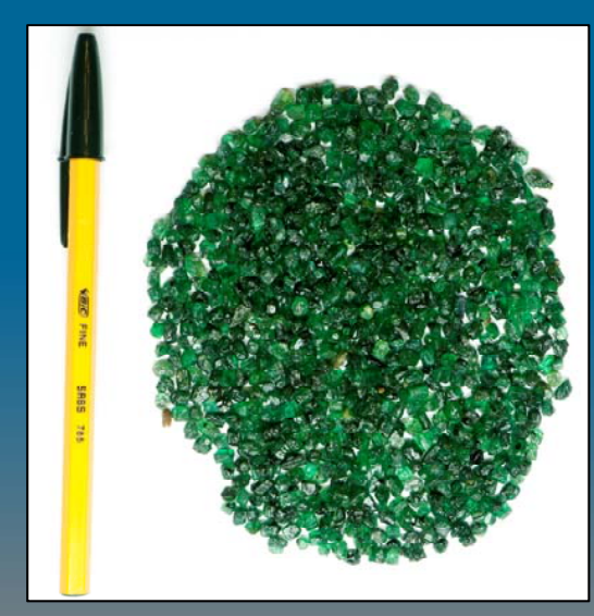
Tumbled Emeralds 3mm