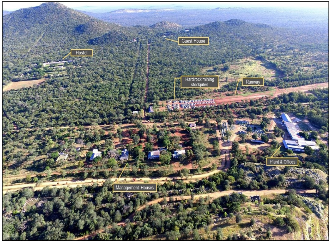
Gravelotte Project showing existing infrastructure and mining stockpiles