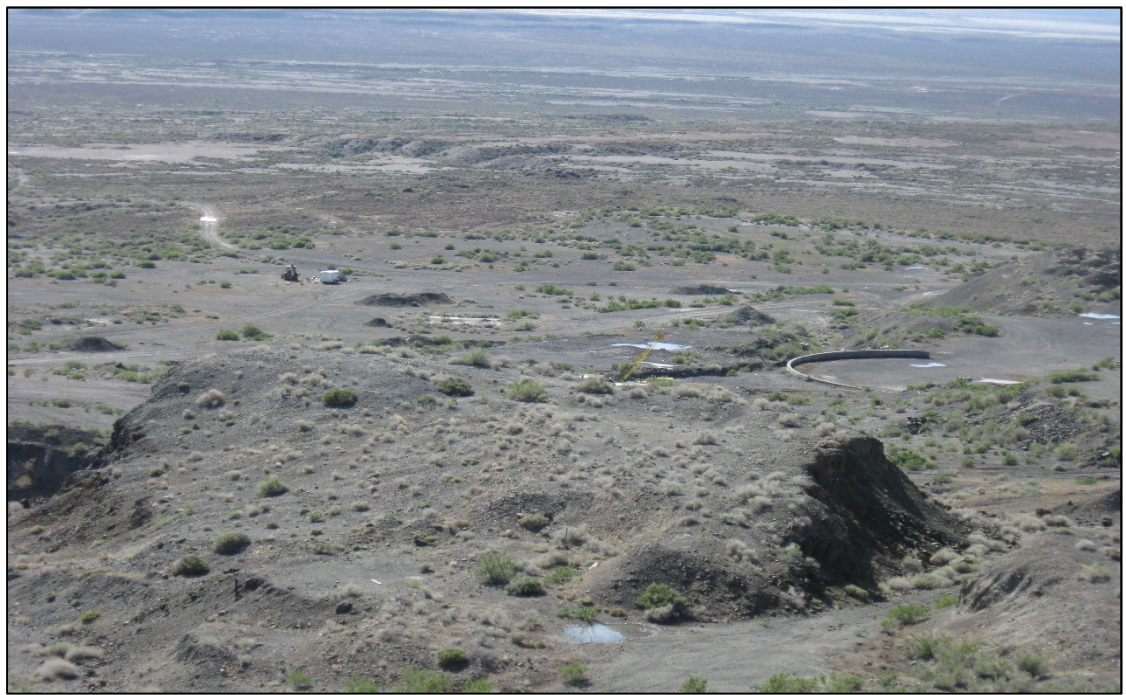
Buena Vista Project Area showing historic loadout facility and stockpiles

Magnum is of the opinion that the Buena Vista data base is sufficiently detailed to allow a JORC 2012 mineral resource estimate to be carried out without additional drilling or other technical activities such as metallurgical test work or geotechnical studies. As a consequence the work required to update the NI43-101 estimate to JORC 2012 will comprise verification of the data base and confirmation of the mineral resource estimate using three dimensional software.