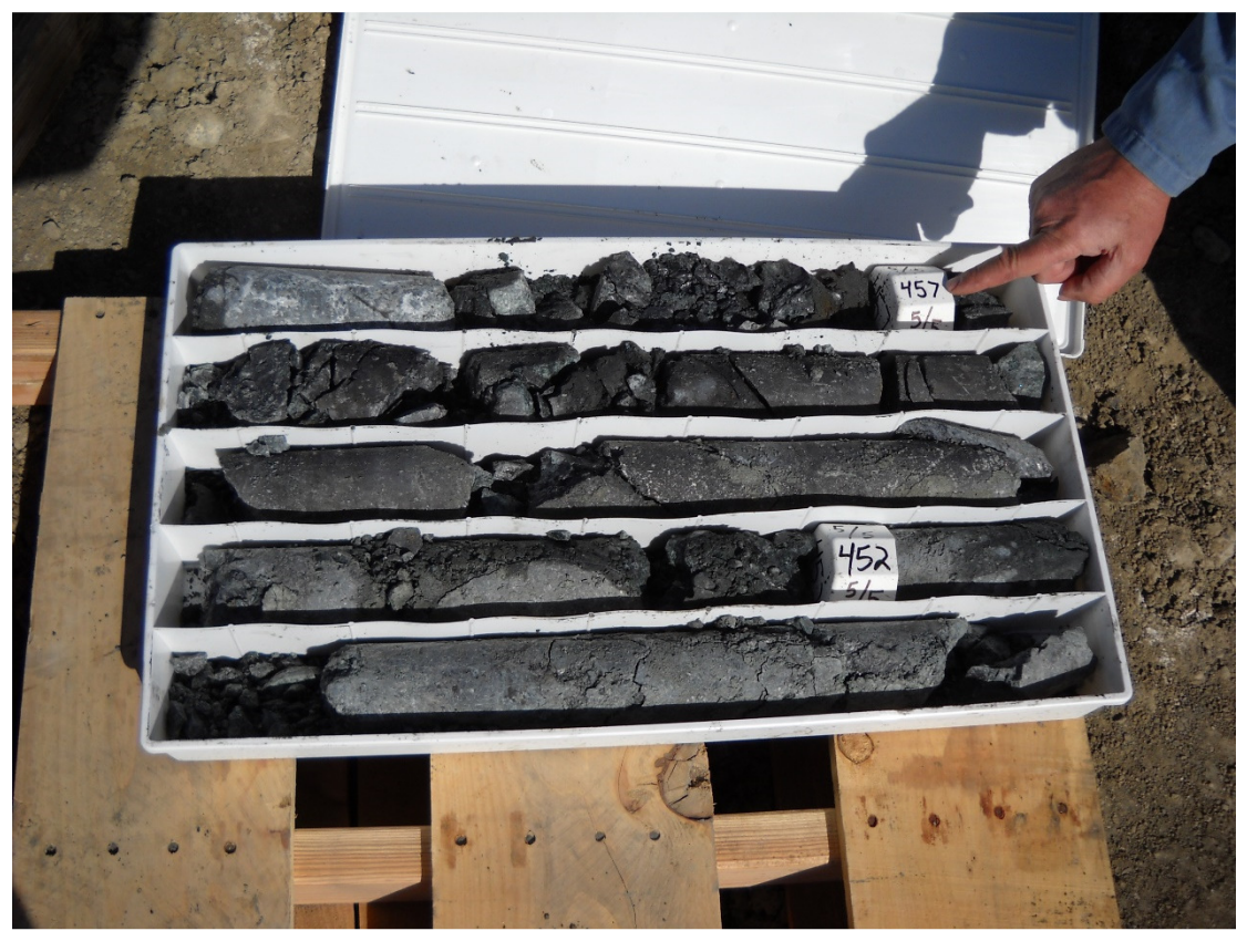
Massive high grade magnetite core

The mine is located in Churchill County in the State of Nevada which has a strong history of supporting mining developments and is easily accessed via the sealed Coal Canyon road.