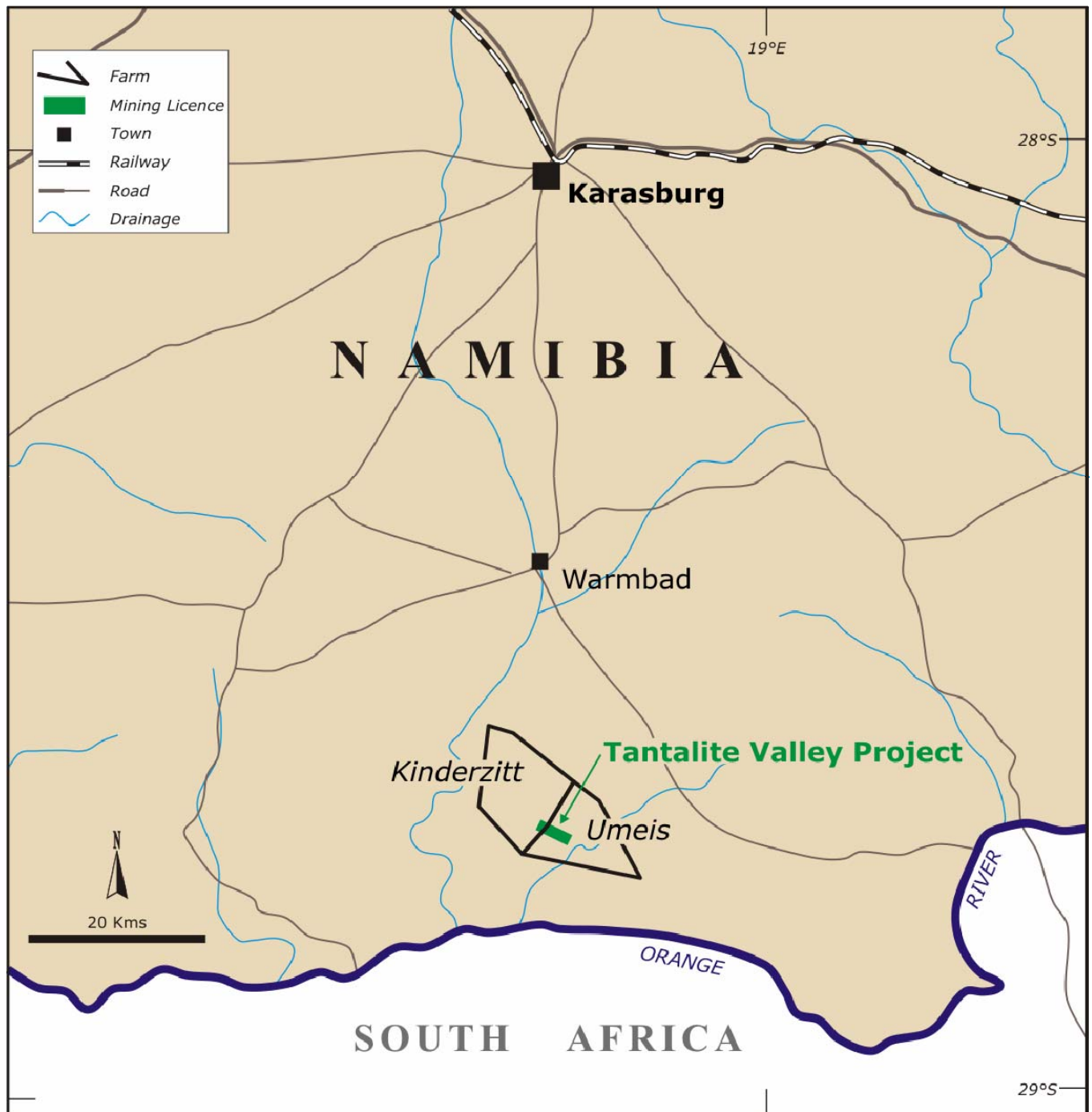
Figure 2. Location of Tantalite Valley Project

The Project is located on Mining Licence 77 ("the Mining Licence") which was granted in February, 2001 and is valid for life of mine or an initial period of 25 years, renewable up to 15 years at a time. It is located on the farms Kinderzitt 132 and Umeis 110.