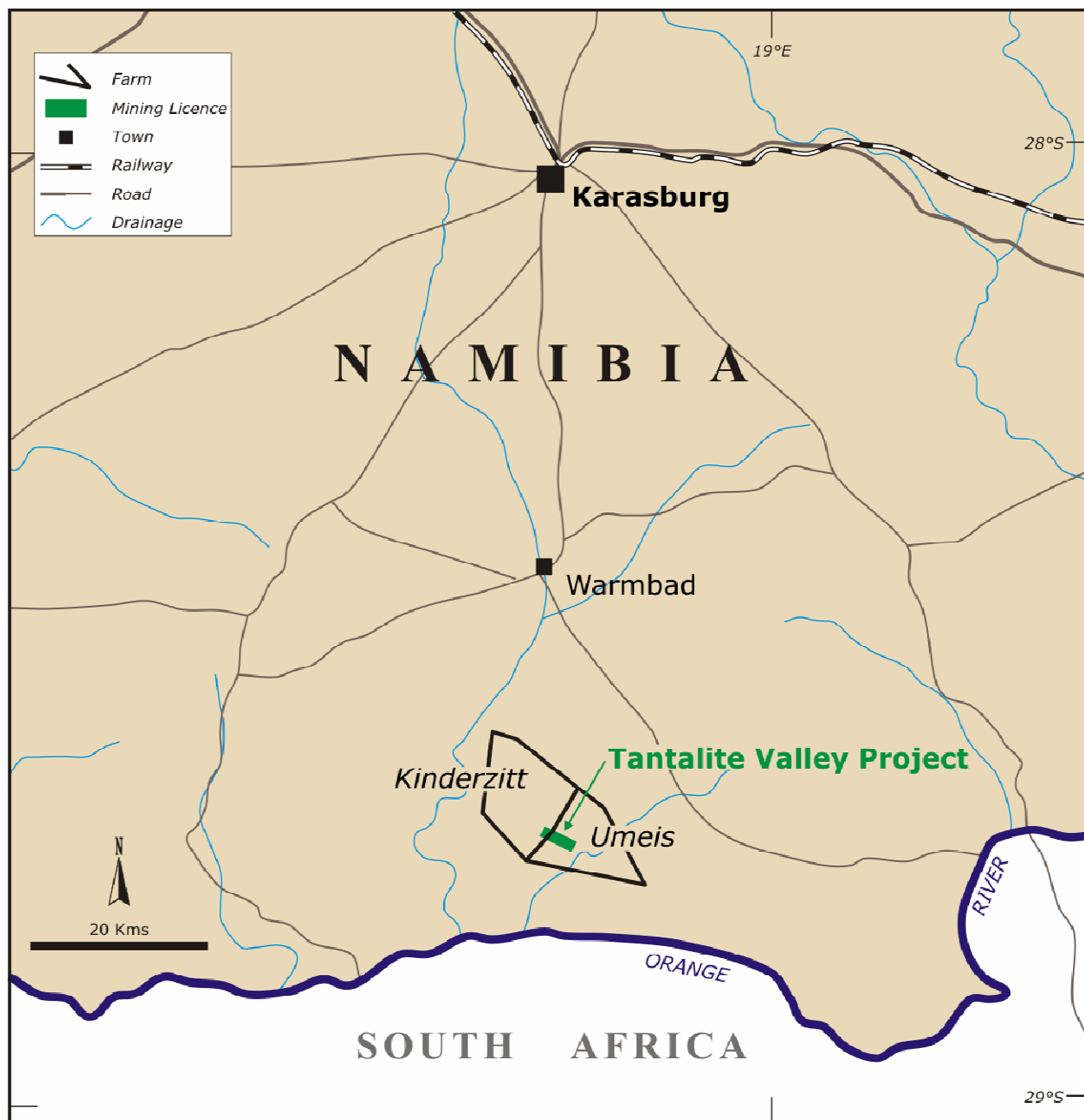
Figure 2. Location of Tantalite Valley Project