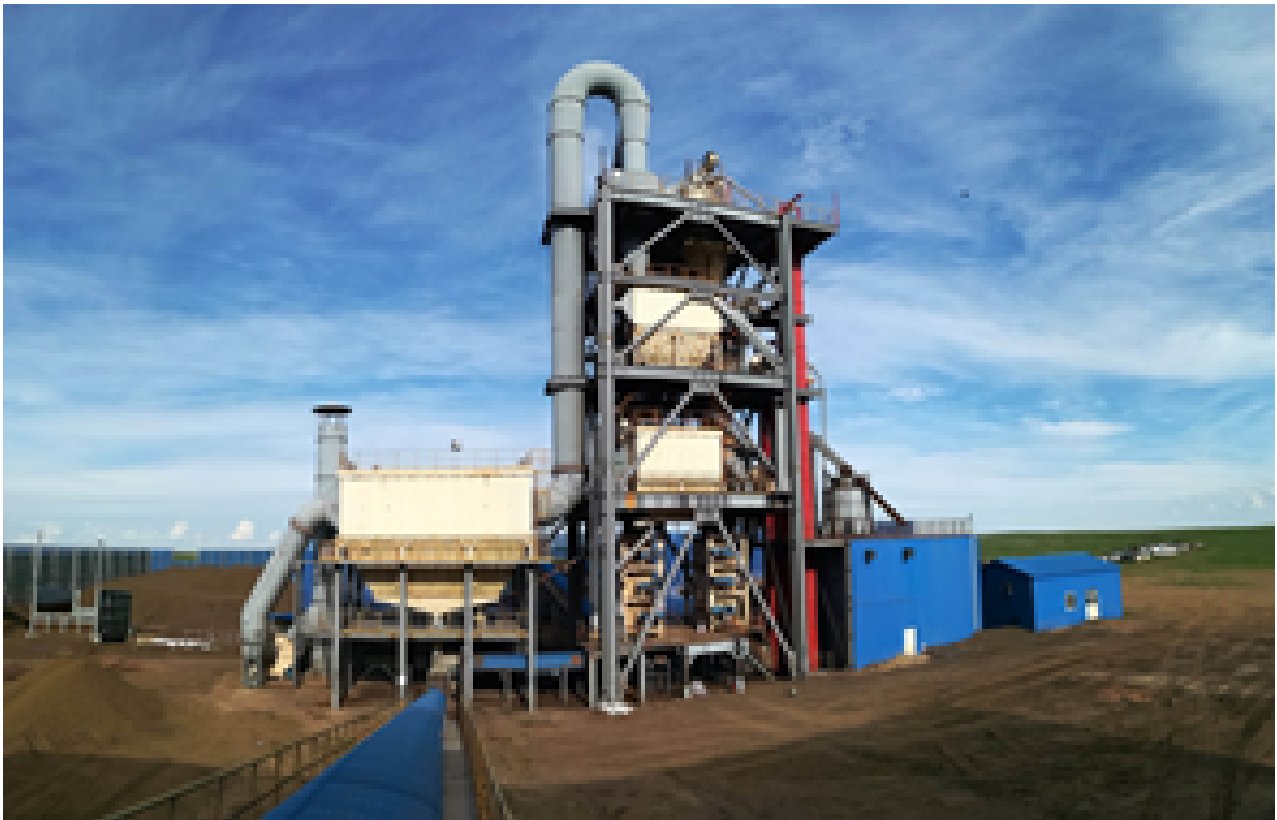
Figure 2 Proposed Dry Magnetic Beneficiation Plant

The outcome from this work will feed into the detailed engineering design and estimates of the capital and operating costs of the dry concentrator.