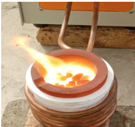
Figure 6 DRI melting