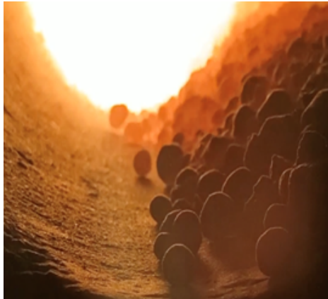
Figure 4 Reduction at 1200C