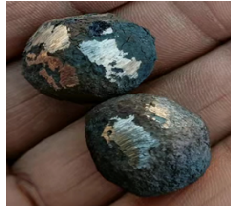
Figure 5 DRI