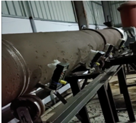
Figure 3 Rotary Kiln

Rotary Kiln and DRI: The pellets were then fed into the rotary kiln where the temperature in the kiln was 1200 Celsius. As the pellets moved along the kiln, the reduction process took place and DRI produced.