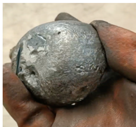
Figure 7 GREEN pig iron

SGS has confirmed the pig iron quality as follows: