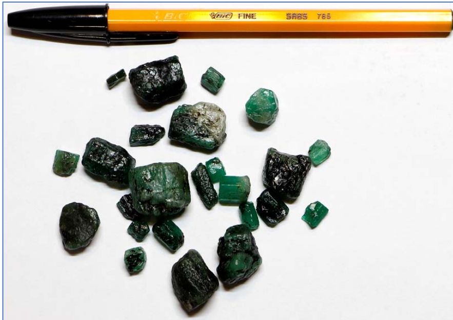
Photo 3: Partially cleaned emeralds ranging from 3.5 to 41.5 carats in weight and 5-25mm is size

The positive however is that within these dumps there is material of high grade and as additional material is processed we will gain a more statistically robust understanding of what average grade the dumps may provide.