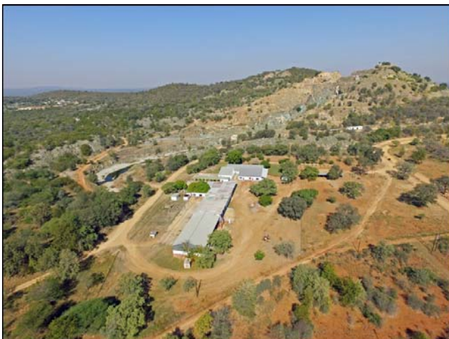
Photo 1: Aerial view of the Gravelotte Mine Site showing key infrastructure with Cobra and Discovery Pits in background.

The project offers established infrastructure, existing and accessible open cuts together with extensive low grade dumps, a large (albeit incomplete) historic data base, a nearby and available work force, local on-site technical expertise and a nearby township that can serve as a supply centre.